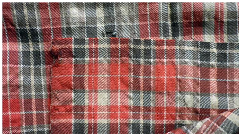
Fig 4. Detail of the colours used in the Unnamed tartan.