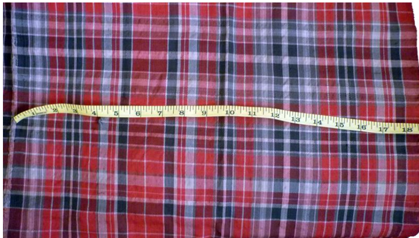
Fig 2. The 19 inch width of the cloth running from the blue join for 3 half setts.

half setts across the warp meaning that either edge could have been joined and the pattern would have repeated correctly. Here the material is joined at the blue pivot (Fig 2).