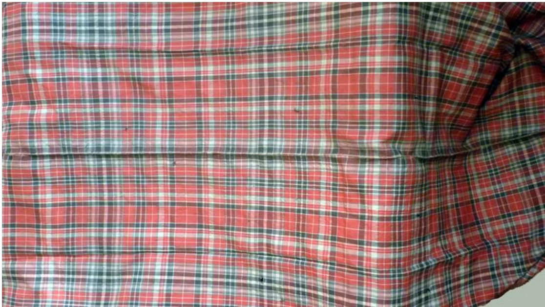
Fig 1. Joined plaid of an unknown tartan.

In researching the principal piece of the Lot I was able to track down the owner of the second plaid who was kind enough to allow me the opportunity to examine it. The piece turned out to be a finely woven joined plaid of a previously unknown tartan made from two 19 inch single-width lengths of material joined at the selvedge to give a finished plaid of approximately 38 x 80 inches (Fig 1).