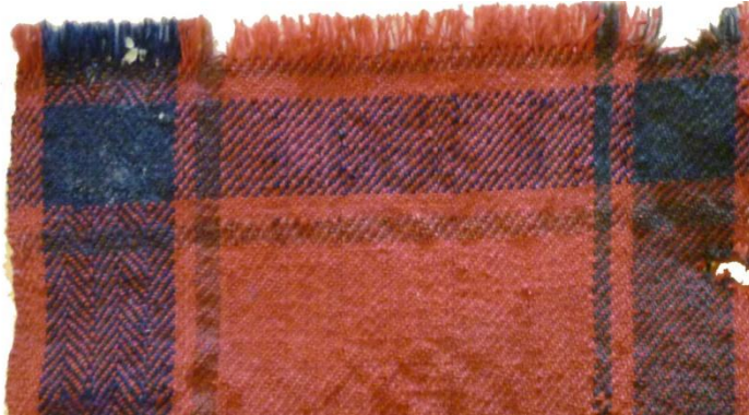
Fig 5. A C18th repeating sett with herringbone selvedge.

The effect of a herringbone is to make that section slightly thicker and looser so it probably had a dual function, principally of being decorative but also of allowing the fabric to move or flow more effectively which might have been an added advantageous in a belted plaid.