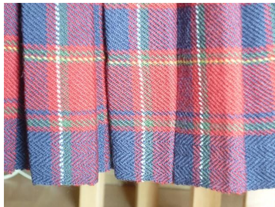
Fig 11. Modern kilt with herringbone selvedge.

Today these traditional selvedge techniques are completely unknown on commercial cloth and so the reader is unlikely to see modern examples. That is not to say that they cannot be done given the desire and knowledge to do so – see Fig 11.