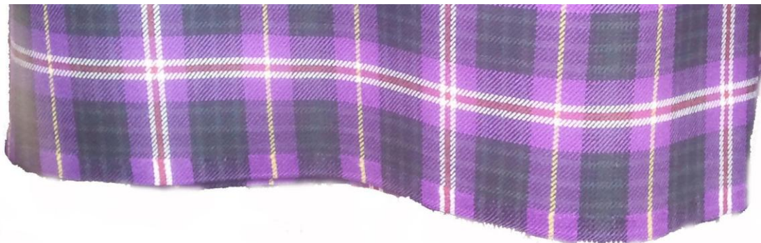
Fig 2. Glued hem on a modern kilt.

A number of selvedge types were historically used in tartan weaving but many of the techniques disappeared as mass production took over and the use of cloth changed. Today a lot of industrially produced tartan is woven without a selvedge and then finished with a type of glued hem that functions like a selvedge, certainly on finer cloth, although it bulks the edge when used on heavier cloth and looks ungainly and cheap (Fig 2).