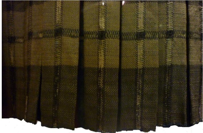
Fig 7. Black herringbone selvedge mark on a c1820 78 th Regiment kilt.

With the ban on the wearing of Highland Clothes during the Proscription (1747-82) selvedge marks would probably have died out but, like other aspects of traditional dress, they continued on in cloth for the military. It's logical to assume that at least some of the early military plaids that were woven in the Highlands would have had selvedge marks and if not already standard, this feature was probably adopted uniformly once larger runs were being ordered from the Lowland weavers. Early C19th military counts include specifications for selvedge marks on plaids for the 42 nd , 78 th , 79 th , 92 nd and 93 rd regiments 2 . This practice continued until about 1810-15 when the belted plaid was dropped in favour of the kilt for all uses. The fact that plaid material was sometimes used for kilts during the early 1800s is evident from the Officers' weight cloth used in a c1810-20 kilt with a broad black herringbone selvedge mark (Fig 7).