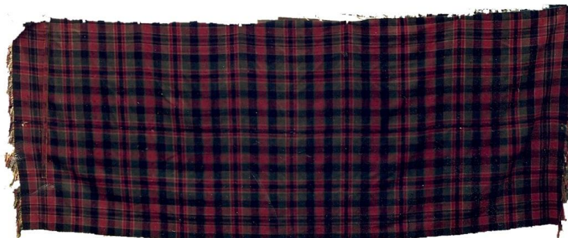
Fig 10. Nova Scotia plaid showing total border pattern.

The two plaids are the only known examples to show this technique, which I've termed a total border . It's an extraordinarily difficult feature to weave and can be regarded as the zenith of the tartan weaver's art. The dimensions of the joined plaid, together with tasselled ends, means that it was not made to be worn and so was probably intended for domestic use in the same way as the blanket pattern plaids.