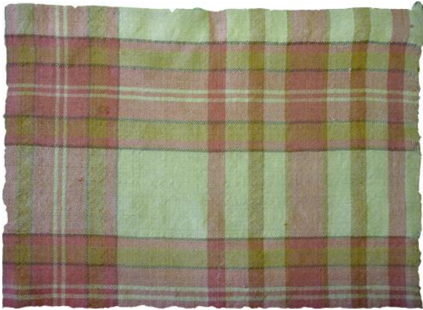
Fig 8. A typical selvage pattern on an early C18th barred blanket.

this one continued to be woven by Wilsons of Bannockburn, including the 'border' until the 1820s at least. The Scottish Tartans Authority has details of at least ten such setting from the 18 th and early 19 th centuries.