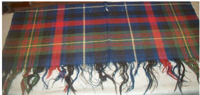
Fig 3. An early C19th example of a balanced weave with the sett repeating evenly from the centre to each selvedge.

Closer examination of a plain selvedge sett shows the pattern continuing in standard 2/2 twill weave to the edge of the material (Fig 4) in which piece the diagonal warp running top left to bottom right is clearly visible. This basic twill selvedge is the standard way in which cloth was woven from the post-Proscription period and continued to be until the modern non-selvedge looms were introduced in the late C20th.