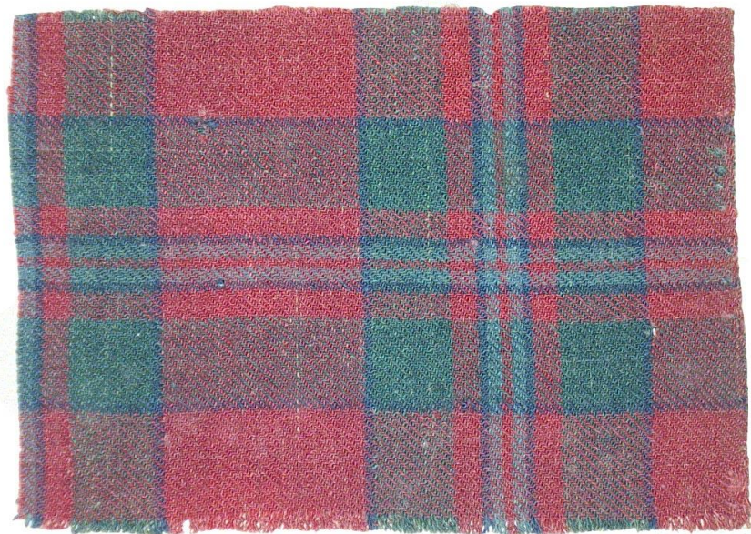
Fig 4. C18th specimen with a basic twill weave selvedge

Mention has already been made of the use of herringbone selvedges. These are often found on old plaids, although not all old plaids were woven with a herringbone selvedge. Examples show that it was used on both plain and decorated selvedges well before the mid-C18th.