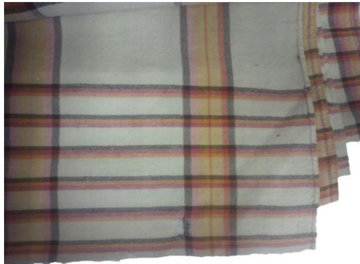
Fig 9. Christina Young blanket showing the double barred selvage pattern.

But for the chance discovery of two plaids in Nova Scotia it might have been assumed that these selvage patterns were restricted to white (arisaid) type domestic blankets. Full details of these plaids are here but for the purposes of this paper this important point is that both, one single width and one a joined plaid, are all tartan (as opposed to a white arisaid sett) and are surrounded by a complete border of a different sett (Fig 10).