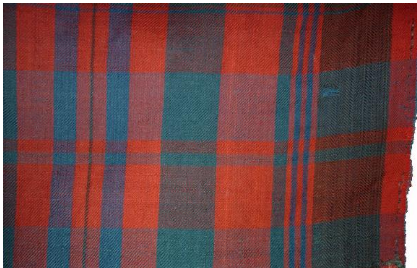
Fig 6. c1800 plaid with a black herringbone selvedge mark.

Selvedge Marks are a form of decoration where the pattern is off-set and the sett repeats from the middle of a pivot on one selvedge towards the second where a broad band of colour that is not usually part of the sett is added. Sometimes the band was one of the colours in the tartan, usually blue or black, or in red, blue and green setts a black band was often added. The band either ran to the edge of the cloth or, there was a fine, usually red, stripe right at the edge as in this example of a fine example of a c1800 Murray of Tullibardine plaid that includes a broad black selvedge mark with the herringboning running through and into the red (Fig 6). This plaid was a copy of a much older one which one may assume also had the selvedge mark.