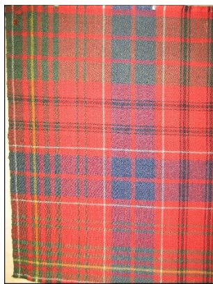
Fig 2. MacRae – HSL 1816