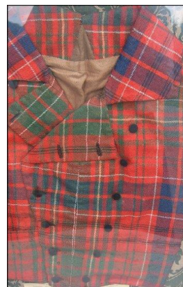
Fig 3. Lumsden Waistcoat

When the settings of the Prince's Own (below - top) and Lumsden (below - bottom) settings are compared the similarity of the two is immediately obvious. The first and second pivots of each are marked X and Y. The difference is that the Prince's Own has a white pivot centred on the green whereas the Lumsden has two white stripes spaced apart on a wider green which in effect introduces another bar of green which then becomes the pivot. The second pivot is marked Y to allow for the proportional differences in the graphics caused by the error at X to be appreciated.