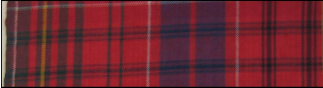
Fig 4. HSL sample showing the offset central green pivot.

As there are no earlier written records of the Prince's Own/MacRae before D.W. Stewart's and the fact that both the Lumsden Waistcoat and the HSL specimens exist, I am drawn to the conclusion that the error was Stewart's in assuming that the white strip was the pivot rather than the green and that the Lumsden setting is the correct historical one for the design irrespective of what it was originally called. Given the fact that the Cockburn, HSL and Lumsden waistcoat are all Wilsons cloth it is quite possible that they came across an old piece associated with the Charles Edward Stewart and were selling it as such which might explain why Andrew Lumsden would have wanted something in it to reflect his earlier association with the Prince's cause.