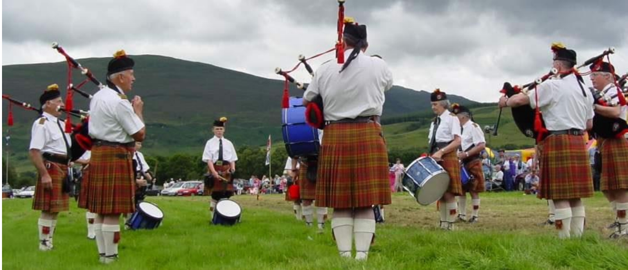
Fig 1. Comrie Pipe Band wearing Strathearn (Muted Colours).

Although considered a District Tartan today, the origins of this unusually vibrant design, which has military and Royal links, is unclear. It fell out of favour in the late 19 th century and remained virtually unknown until the 1980s when it revived for use by the Comrie Pipe Band (Fig 1).