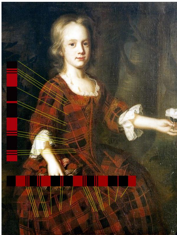
Plate 2. Reconstruction of the bodice and skirt tartans

Perhaps because the portrait remains in private hands and the fact that it depicts a child it has only been included in a few reference books on tartans, notably Hesketh i and Dunbar ii , and as a result has been little studied compared with others of the period. The sitter is not wearing a dress as some have previously stated but is in fact wearing a skirt and separate jacket 5 , the skirts, front, collar and cuffs of which are edged with lace. Dunbar said of the portrait that it was ' The earliest illustration of a lady's tartan dress..... ' which he dated, incorrectly, to 1745 and described the tartan consisting ' of a red ground with dark blue, green or black stripes or lines. ' Having had the opportunity to study the portrait it 'appears' that there is not one but two similar red and black tartans (no blue or green) of a large sett as the extraction (Plate 2) and reconstructed setts (Plates 3 & 4) show.