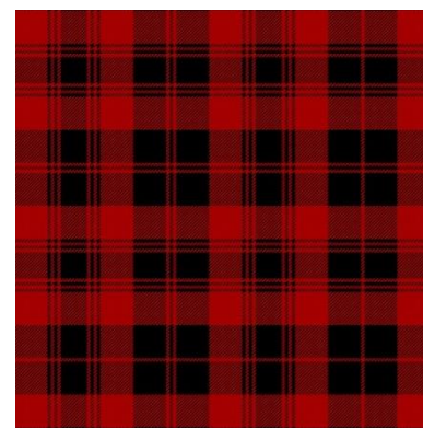
Figure 4. Skirt reconstruction