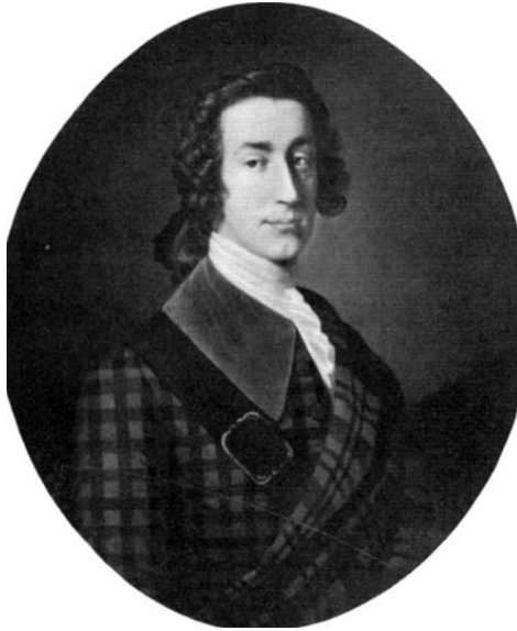
Fig 3. David, Lord Ogilvy - Allan Ramsay c1745

Irrespective of portrait's origins, it and Ramsay's contemporary portrait of David, Lord Ogilvy (Fig 3) are the earliest representations of the black and red tartan worn in clothing other than hose 3 . Ogilvie was probably painted in Sep when Ramsay was summoned to Edinburgh and Charles was painted around the same time during the period he held Court at Holyrood. Shortly after the failure of the '45 Ramsay painted another two portraits 4 in which the subject wears a similar outfit of jacket and trews in the black and red check: Norman MacLeod of MacLeod, 22 nd Chief (Fig 4) and Francis, 7 th Earl of Wemyss (Fig 5). Wemyss also wears a plaid in the same tartan whereas MacLeod's plaid is Murray of Tullibardine.