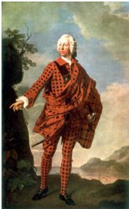
Plate 4. Norman MacLeod 22nd Chief by Allan Ramsay c1748

Irrespective of portrait's origins, it and Ramsay's contemporary portrait of David, Lord Ogilvy (Plate 3) are the earliest representations of the black and red tartan worn in clothing, other than hose 3 . Ogilvie was probably painted in Sep 1745 when Ramsay was summoned to Edinburgh and Charles was painted around the same time during the period he held Court at Holyrood. Shortly after the failure of the '45 Ramsay painted another two portraits 4 in which the subject wears a similar outfit of jacket and trows in the black and red check: Norman MacLeod of MacLeod, 22 nd Chief (Plate 4) and Francis, 7 th Earl of Wemyss (Plate 5). Wemyss also wears a plaid in the same tartan whereas MacLeod's plaid is Murray of Tullibardine.