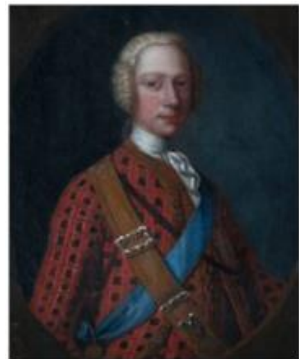
Fig 2. Prince Charles Edward Stuart wearing the black and red tartan c1745-6.

The first evidence we have for this tartan is Wright's portrait of Lord Mungo Murray 1 c1680 in which he wears black and red diced hose (Fig 1). Judging by the widespread depiction in portraits diced checks were more often favoured over more complex designs for hose, probably because the small repeat was easier to weave, cut and match than a larger sett. In terms of tartan research the Wright portrait is quite early. Most portraits and extant specimens belong to the 18 th century amongst which are several portraits painted around the time of the '45 Rising, three of which are explored later were by Allan Ramsay and bear similarities. An unrelated portrait shows Prince Charles Edward (PCE) wearing a red and black diced coat and waistcoat said to have been found amongst the baggage train of the Jacobite Army at Culloden (Fig 2). The portrait 2 looks to have been painted from life but it is not clear when or where it was produced nor if the Price actually wore the outfit or whether it was a form of romanticised Jacobite propaganda.