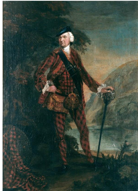
Fig 6. MacGregor of Glengyle c1740-50

Glengyle 6 is pictured wearing a waistcoat and trews of black and red dice, a plaid of the same tartan lies close by while his jacket is of a more complex red and black (possible blue and/or green) with evidence of finer overstripes. This mix of tartans together with other elements of the dress suggest that it was painted from life in which case it is reasonable to postulate that these were Macgregor's own cloths rather than studio props. The possibility that MacGregor may have worn his own clothes does not mean that these were either a Glengyle or broader MacGregor tartan.