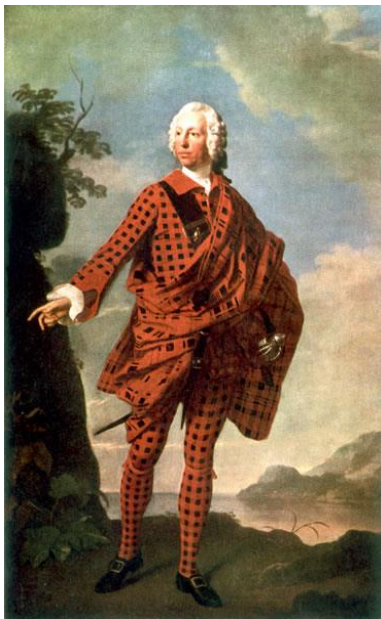
Fig 4. Norman MacLeod 22nd Chief - Allan Ramsay c1748