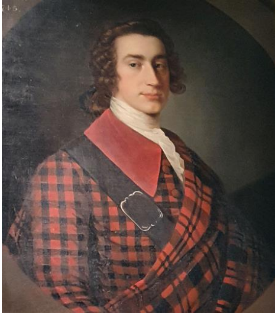
Plate 3. David, Lord Ogilvy by Allan Ramsay 1745

Irrespective of portrait's origins, it and Ramsay's contemporary portrait of David, Lord Ogilvy (Plate 3) are the earliest representations of the black and red tartan worn in clothing, other than hose 3 . Ogilvie was probably painted in Sep 1745 when Ramsay was summoned to Edinburgh and Charles was painted around the same time during the period he held Court at Holyrood. Shortly after the failure of the '45 Ramsay painted another two portraits 4 in which the subject wears a similar outfit of jacket and trows in the black and red check: Norman MacLeod of MacLeod, 22 nd Chief (Plate 4) and Francis, 7 th Earl of Wemyss (Plate 5). Wemyss also wears a plaid in the same tartan whereas MacLeod's plaid is Murray of Tullibardine.