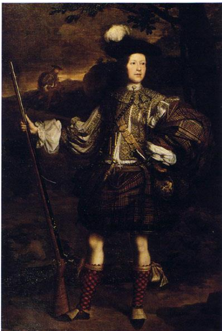
Plate 1. Lord Mungo Murray c1680 by Michael Wright.