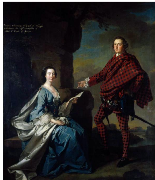
Fig 5. 7th Earl of Wemyss - Allan Ramsay c1748