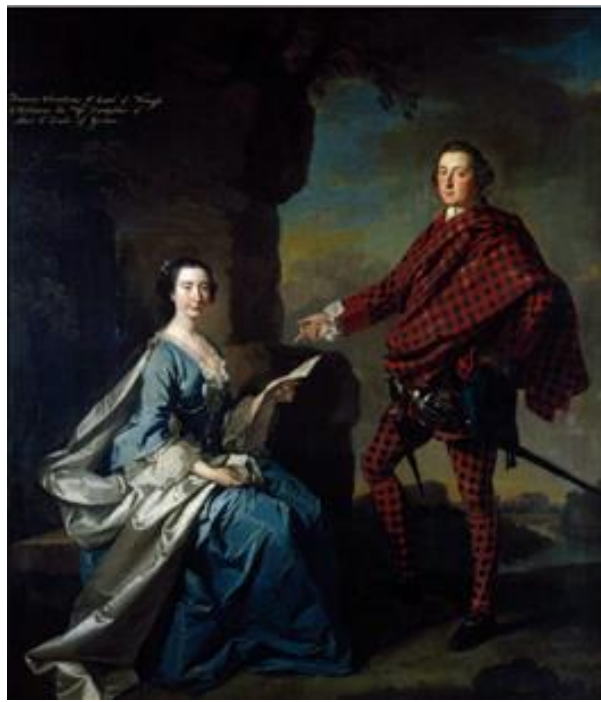
Plate 5. Francis Charteris, 7th Earl of Wemyss by Allan Ramsay c1748

Comparison of all three Ramsay portraits reveals remarkable similarities in the style of jacket; so much so that it's entirely possible that they were in fact the same and that the one in the earlier Ogilvie portrait was used as a template for the latter two. Ramsay was renowned for his ability to paint faces and hands but he often sub-contracted interiors and