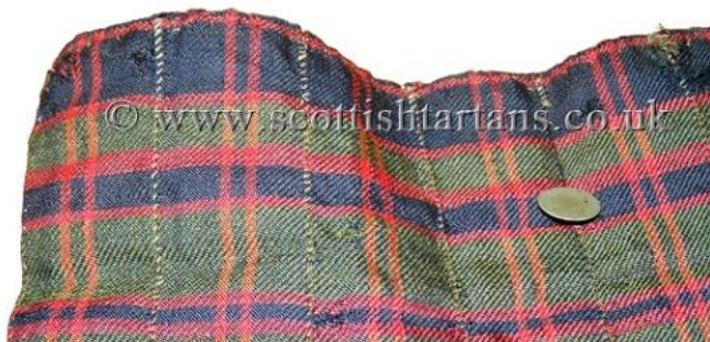
Fig 2. Metal button at the waist (rear).

There is a single plain metal button just below the waist between the fourth and fifth pleats (Fig 2) with no evidence of similar buttons elsewhere. This may suggest that it was part of the fastening, perhaps an anchor for a waist-tie which was the standard fastening method in the early 19 th century.