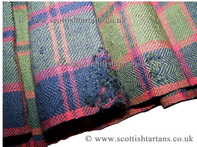
Fig 3. Detail of the herringbone selvedge.

The hand-woven cloth is 25" wide and of a good quality, woven with evenly spun singles (non-ply) yarn that was naturally dyed. Even without being tested it's clear that the dyes are likely to be those typically used in pre-19 th century rural tartan; cochineal and indigo for the red and blue respectively, plus indigo and an unknown yellow source for the green. The pattern is offset across the material and finishes in a four bar herringbone on one selvedge, the bottom of the kilt (Fig 3). This navy blue selvedge with a final thin red band is typical of a technique often found on 18 th century plaids 4 . The number of bands and exact number of threads in