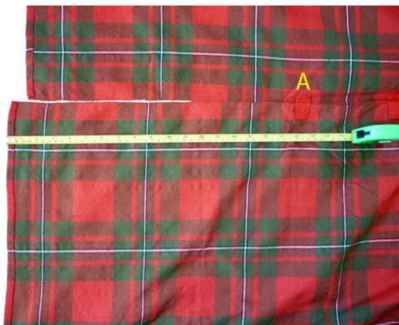
Fig 3. Unsewn apron section.

Fig 3 shows one of the unjoined aprons as well as the slight difference in the overall length of the upper and lower pieces of cloth due to the misalignment of the sett. The turned ends of the material are also clearly visible. The last tape for the draw string is marked the 'A' and the unsown apron begins at the green immediately to the left of the tape. Depending on which way up the plaid was worn would mean that the unsown apron would be 15 or 16 inches wide which, even allowing for some wrap-around of the pleated section indicates that this was made for a slim man.