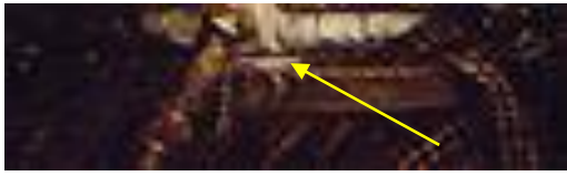
Fig 6. Detail of the drawstring plaid c1680.

doesn't really help in determining which side the drawstring was worn. If worn on the apron then the drawstring would have to be on the inside of the cloth but if worn on the corner of the upper or cloak section of the plaid then the drawstring would have to be on the outside. As the pleats are unsown then technically the plaid could be worn with the drawstring inside