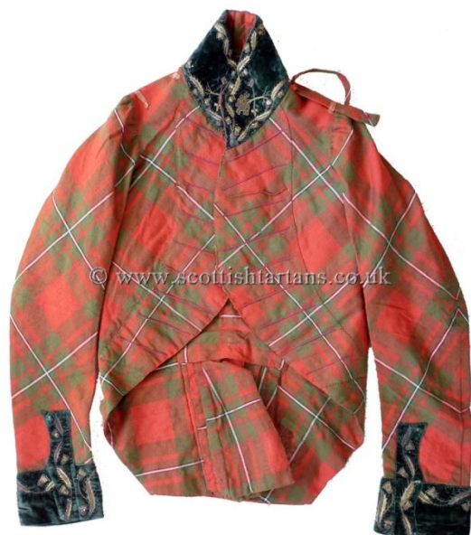
Fig 8. MacGregor jacket showing longer tail.

The coat itself, which will be the subject of a separate paper , has a number of interesting features; notably, the two epaulette strips on either shoulder to take a matching tartan strap for fastening the plaid meaning it could be worn on either shoulder.