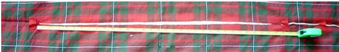
Fig 7. Unjoined central section of the plaid.

Finally, there is the question of the unsown section in the middle of the plaid (Fig 7). At 32" long, perfectly balanced across the sett and with drawstring tapes at either end to strengthen it, this is clearly a deliberate feature as opposed to a section where the sewing has come undone. Although there aren't too many complete extant examples, no other plaid of any age