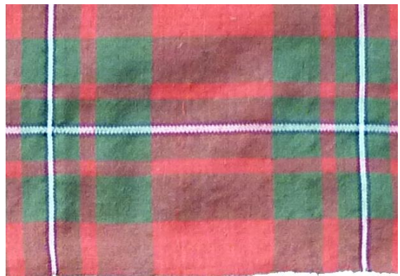
Fig 1. Selvedge finished at the red pivot.

The setting is balanced across the material which finishes in the centre of the red square (Fig 1) meaning that it could be used single width or, as in this case, joined to make a traditional plaid.