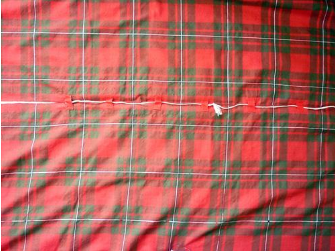
Fig 4. Position of the drawstring along the central join.

There are 14 tapes approximately 1" long x 0.5" wide crudely sewn along the length of the plaid, 7 either side of the central unsown section. The placing of the tapes means that the wearer was either quite tall or it was tied off above the waist and then perhaps folded over. In picture below (Fig 4) a rudimentary drawstring has been added to the section on one side of the central unsown centre to show the drawstring's position on the plaid.