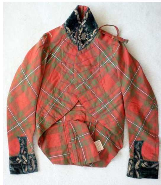
Fig 8. MacGregor jacket showing longer tail.

The jacket itself, which will be the subject of a separate paper , has a number of interesting features; notably, the two epaulette strips on either shoulder to take a matching tartan strap for fastening the plaid meaning it could be worn on either shoulder.