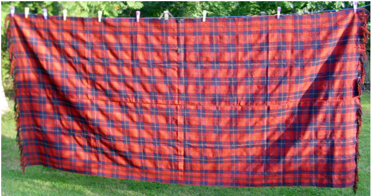
Plate 1. Overview of the Plaid.