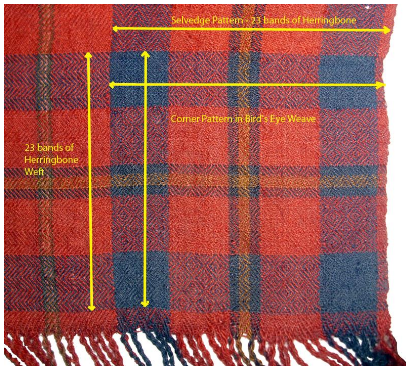
Plate 3. Intersection of the warp and weft herringbone to give Bird's-Eye pattern in each corner.

A similar technique was used in the corresponding weft sections of the cloth where there are 23 bars of chevron weave 7 resulting in the corner design being Bird's-Eye weave 8 (Plate 3).