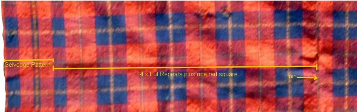
Plate 2. Layout of the Plaid showing main body, selvedge pattern and join.

There are 23 bands of herringboning which finish in the traditional blue band and red stripe arrangement commonly found on the edge of many old plaids. All the bands are 10 ends (threads) wide except for the light green band which is only 8 threads. The result is a change of direction at the start of each band until the blue immediately after the green when each subsequent band and colour change happens on the third thread (Fig 2).